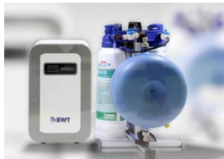
bestaqua coffee BL5Q0914