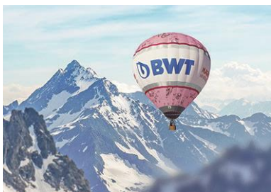
Heißluftballon Berge A5_quer

The prize includes a 3-night stay with half board and a balloon ride in the Lungau region. The winners will be responsible for making their own return travel arrangements. But BWT water+more will be contributing a generous sum towards the costs of travel. To take part, visit BWT water+more at Stand C5 or online at www.bwt-wam.coffee .